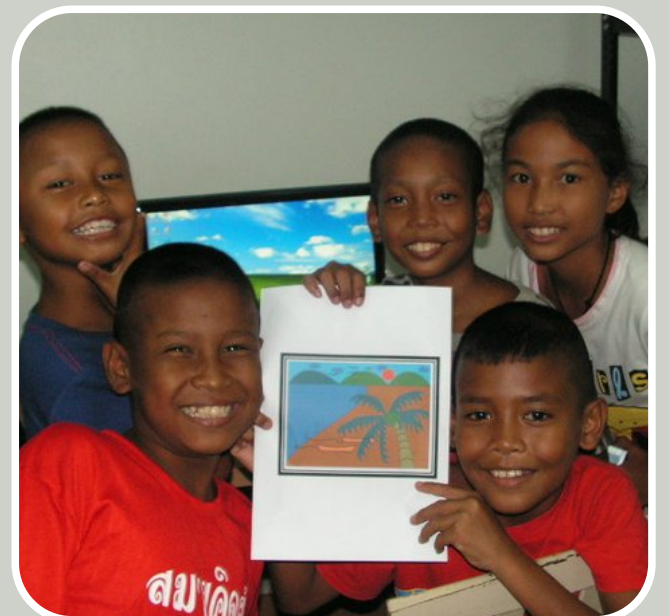
Happy children at SOS Children's Village Children used the computers and printers that BCO donated for the first time.