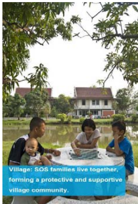
Village: SOS families live together, forming a protective and supportive village community.