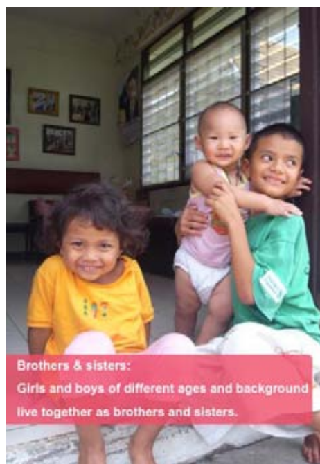
Brothers & sisters: Girls and boys of different ages and background live together as brothers and sisters.