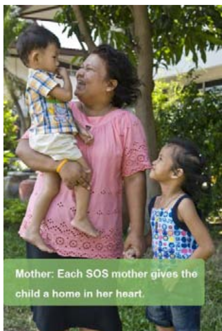
Mother: Each SOS mother gives the child a home in her heart.

Children were brought home to SOS Children's Village. They are received the care in SOS's family "A loving home for every child" by our four principles which are: mother, brothers and sisters, house and village.