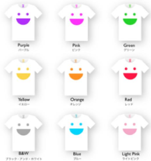
iwise FAMILY for Kids

600THB { 1 T-Shirt for you. 1 T-Shirt for kid will donate to a child 450 will donate to Childline Thailand Foundation.