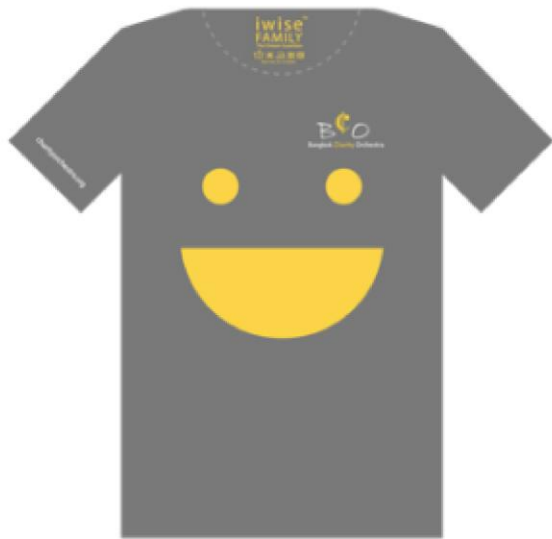
iwise FAMILY & BCO Limited Edition