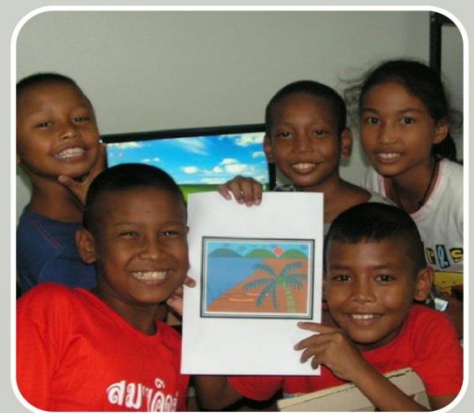
Happy children at SOS Children's Village Children used the computers and printers that BCO donated for the first time.