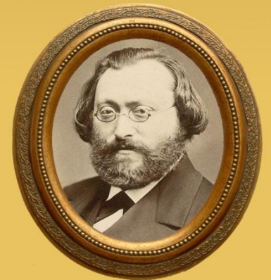
Max Christian Friedrich Bruch (1838-1920)

Max Christian Friedrich Bruch was one of the most respected composers of the Romantic period. Unfortunately, by his later years, most of his numerous compositions; including operas, symphonies and chamber works, were largely neglected, except for 2 remarkable works that have gained places in the regular concert repertoire until now; namely, the Scottish Fantasy for Violin & Orchestra, Op 46 and the Violin Concerto No. 1 in G minor, Op 26 featured in tonight’s concert. Bruch completed the first version of the G minor concerto in 1866. However, after its first performance, the composer made extensive revisions of the score under the suggestions of Joseph Joachim, the great violin virtuoso of the period.