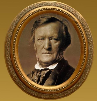
Wilhelm Richard Wagner (1813-1883)

The premiere of the complete opera was given in Munich in 1868 under the baton of Hans von Bulow, the great German conductor and has become one of the most accessible and successful operas despite its great length and historical subject.